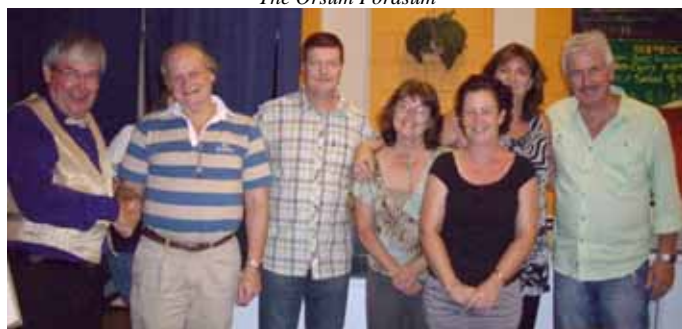
“The Orsum Fordsum”