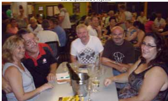
“the Unfinished Projects”

With the huge amount of prizes donated by the sponsors there were plenty of winners. The Classic Ford Car Club entered two teams and amazingly those teams (The “Orsum Fordsum” and “Henries Heroes”) came first and last and I dare say I know where the brains trust of the club lay.