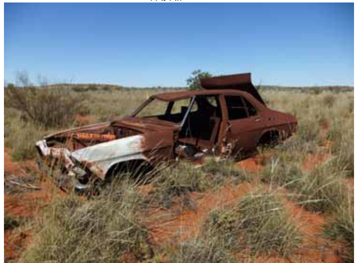
“ HQ RIP”

We encountered our first lot of locked caged bowzers at the Docker River roadhouse and noted that the price of petrol was $1.90 litre( it was $1.97 at Renner Springs! We camped at Kaltukatjara was just past Docker river, where there were 8 big shaded campsites, taps with water, toots on cement slabs with working plumbing. At the NT/WA border road signs on the Great Central were plentiful but scarce for the remainder of the road. The corrugations continued with varying intensity. With instinct we located the Len Beadell plaque in a very tall gum tree near a range known as the Schwerin Mural Crescent which was picturesque with the brown rocks, white gums and Spinifex. We passed 10 old land rovers on the side of the road having a cuppa and then traveled 3 km through a forest of desert oaks. The Giles weather station information centre was our next stop. We marveled at the remains of the blue streak missile and the Len Beadell grader.