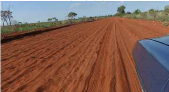
“Wolfe Creek Crater road”

We encountered our first lot of locked caged bowzers at the Docker River roadhouse and noted that the price of petrol was $1.90 litre( it was $1.97 at Renner Springs! We camped at Kaltukatjara was just past Docker river, where there were 8 big shaded campsites, taps with water, toots on cement slabs with working plumbing. At the NT/WA border road signs on the Great Central were plentiful but scarce for the remainder of the road. The corrugations continued with varying intensity. With instinct we located the Len Beadell plaque in a very tall gum tree near a range known as the Schwerin Mural Crescent which was picturesque with the brown rocks, white gums and Spinifex. We passed 10 old land rovers on the side of the road having a cuppa and then traveled 3 km through a forest of desert oaks. The Giles weather station information centre was our next stop. We marveled at the remains of the blue streak missile and the Len Beadell grader.