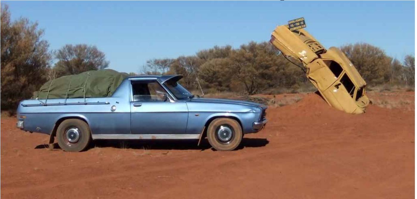
“Tjukayirla roadhouse advertising,”