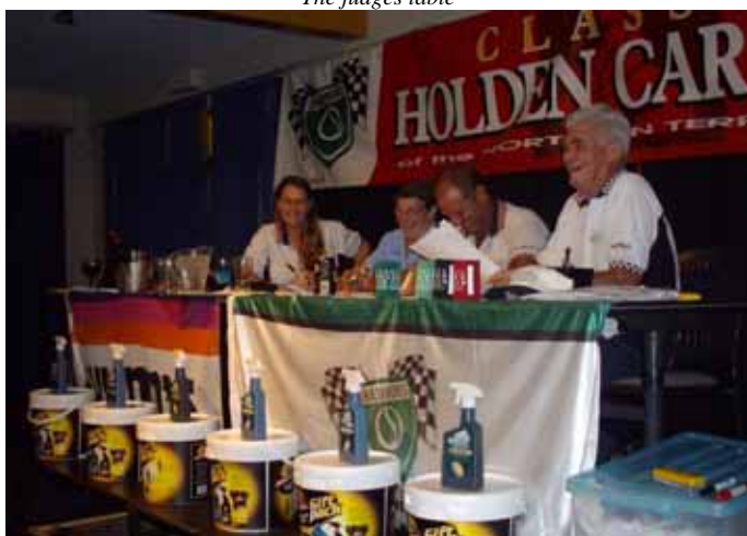
“The judges table”

Most kick started the night off early and made the most of the fabulous meals prepared by the kitchen staff. From there the games commenced. As well as the traditional rounds we add some excitement into the mix with many other activities on the night. Two lucky door prizes. The NT Rubber & Fridge seals ‘Guess the Prime Minister’ competition which had six tables getting it right and it was all down to spelling to get a winner!!!! The Rare Spares ‘pick the emblem’ competition. The ‘what am I’ competition which was won with only one clue out of 22 clue prepared!! And the ‘Heads and Tails’ competitions had everyone on their feet looking like geeses.