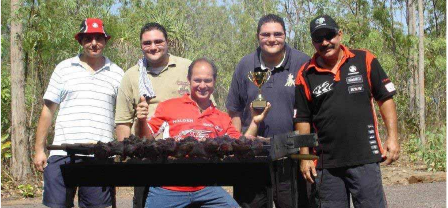
“observant members will notice that this photo was taken from the 2008 City to Souvlaki run but it’s just too good a shot not to use, besides we have the same hosts”