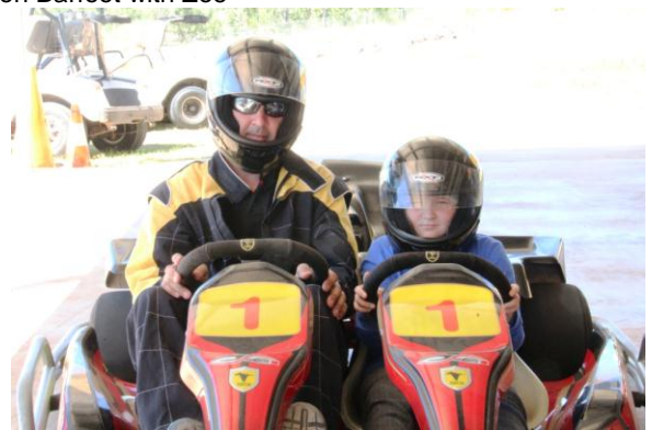
We drew a huge crowd of spectators....

For those who turned up it was an awesome experience the thrills (and sometimes spills) of racing Go Karts on a real racetrack. I have done go karting before but never on a proper racetrack and let me tell you it was soo much funnn.....But don't just take my word for it, talk to those who participated and they will all be eager to give it another go.