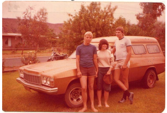
(we like short shorts)